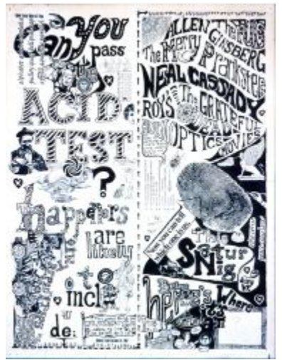
Can YOU pass the Acid Test?

Essentially, what happened at most of these events is that those attending got dosed and hung out together. The 7th and 8th Acid Test parties where huge affairs, one being held at the Fillmore Auditorium and the 8th at the 3-day Trips Festival. These were very significant events and very much attended by the public. After that, there were a small number of other Acid Tests, most held in Southern California, in the Los Angeles area.