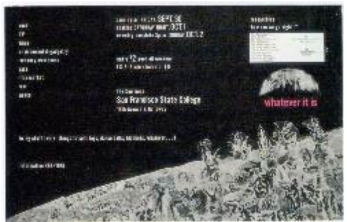
Whatever It Is

Acid test Graduation, 1966-10-31, Commons, San Francisco State College